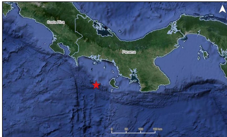
Figure 1 Information from the Earthquake Hazards Program of the United States Geological Survey regarding the earthquake event on 26 August 2024.

A magnitude 5.8 earthquake occurred at 05:08:44 (UTC) on 26 August 2024, located at 89.1 km (55.3 mi) N of Boca Chica, Chiriquí Province, Panama; 107.2 km (66.6 mi) N of Pedregal, Chiriquí Province, Panama and 112.5 km (69.9 mi) N of Las Lomas, Chiriquí Province, Panama. Initial estimates from the United States Geological Survey (USGS) located the epicentre of the event at 7.423°N, 82.290°W, and at a depth of 10 km (6.21 mi) – Figure 1.